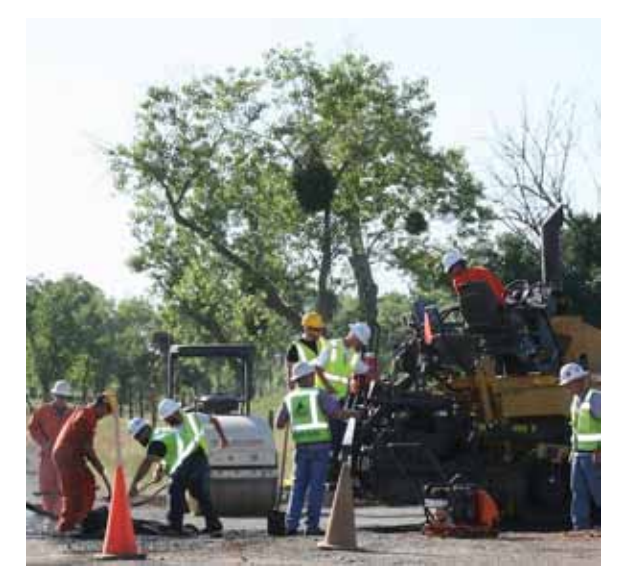
Local 3 apprentices pave the entrance to the new training site in April.

engineers and be able to tell them, 'I built it'," Ravnik said. "It [the new training site] is a true testament to both the vision and the commitment of labor and management to continue to provide the highest quality training of its kind in the nation well into the future."